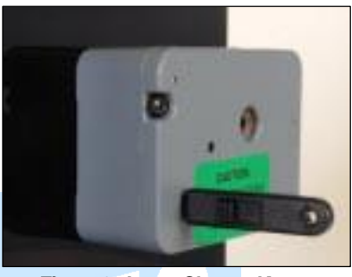
Figure 3 - Insert Change Key

Dial left (CCW) until the Change Key appears in the upper right hand corner of the display.