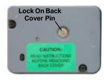
Figure 1 - Lock On Back Cover