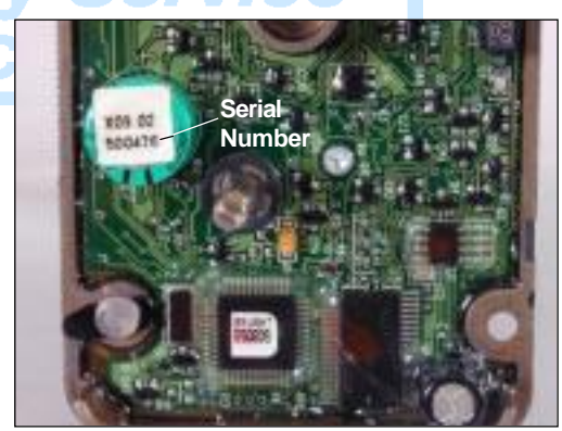
Figure 2 - Serial # on Label on Capacitor